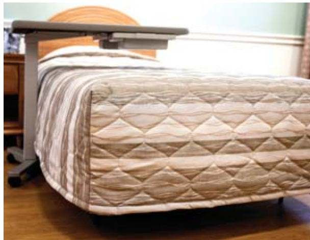
Box Corner Style