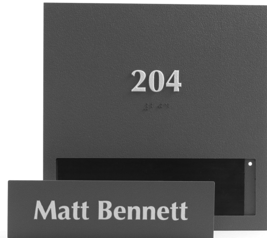
Modular System Shown